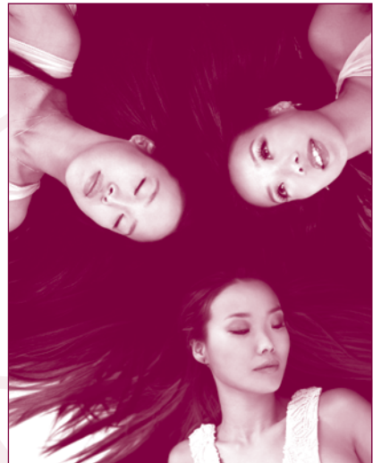
AHN TRIO

You bring the arts and entertainment to the Chippewa Valley!